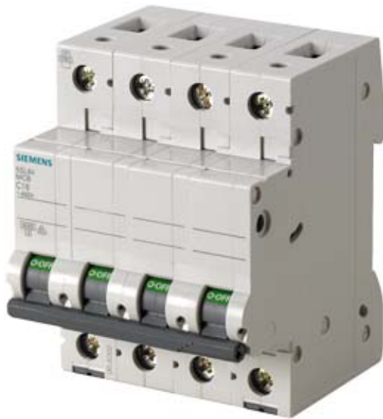
CIRCUIT BREAKER 400V 6KA, 3+N-POLE, C, 25A